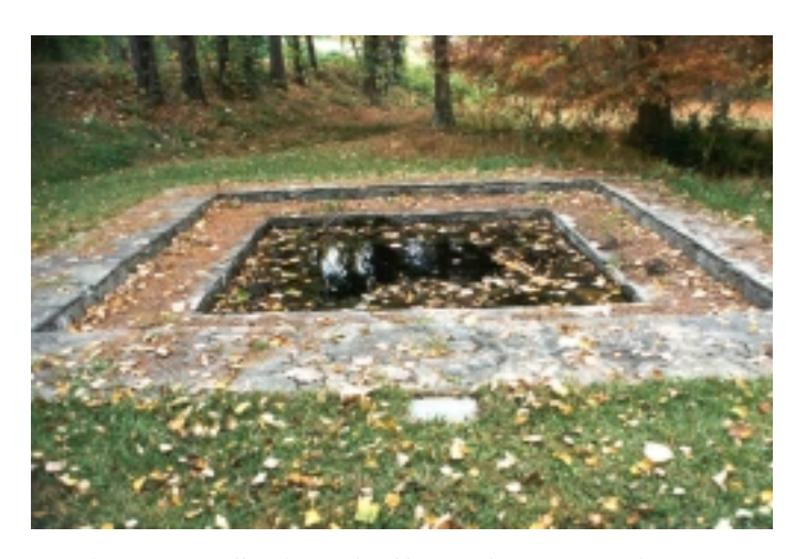
Limestone Spring, Gaffney, Cherokee County

Besides the historical impact of springs on the settlements that later became towns, springs also figured prominently in events such as the Revolutionary War. Both British and American soldiers used Liberty Springs in Cross Hill, Laurens County. One tradition is that during a smallpox outbreak soldiers from both sides remained near the spring for several weeks, and by agreement no fighting occurred near this spring. Another story is that the "Sons of Liberty" used the spring as a meeting place to plan strategy against British rule. Similarly, soldiers used Limestone Spring in Gaffney, Cherokee County, in the revolution. A hotel built near this spring in 1835 later became Limestone Springs Female High School, which is now Limestone College. There is archeological evidence that a spring at William Bates House in Greenville County was in use by Native Americans as much as 3,000 years ago.