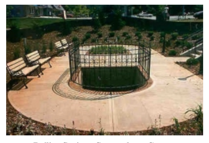
Boiling Springs, Spartanburg County

Traditionally, communities were founded near streams or springs, and many towns indicate the important role of springs in their origin by including the springs in their names. Boiling Springs in Spartanburg County is a good example, as are the towns of Cherokee Springs (also in Spartanburg County), Heath Springs (Lancaster County), and Sandy Springs (Anderson County). Other towns were founded around springs,