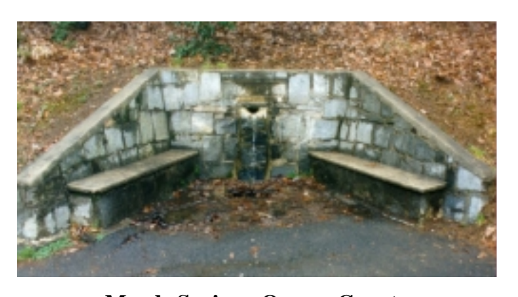
Moody Springs, Oconee County

The chemical properties of springs in South Carolina are similar to those of well water in the same area, which is logical given that they both usually come from the same aquifer. The springs sampled for this study have a median pH of 5.7 and a median hardness of 6.4 parts per million (milligrams per liter), which makes it "very soft" water. The median dissolved solids, calculated from measured temperatures and conductivities, is 25 parts per million, which is very low mineralization. Of great interest to partakers of spring water at the source is the temperature; most spring owners seem to believe theirs is the coldest in the region. Median spring-water temperature sampled was 62 °F (16.6 °C), with the coolest measured at 53 °F (11.4 °C). As for water potability, that is left to the discretion of the person drinking it, as bacteria and other possible contaminants were not evaluated for this study.