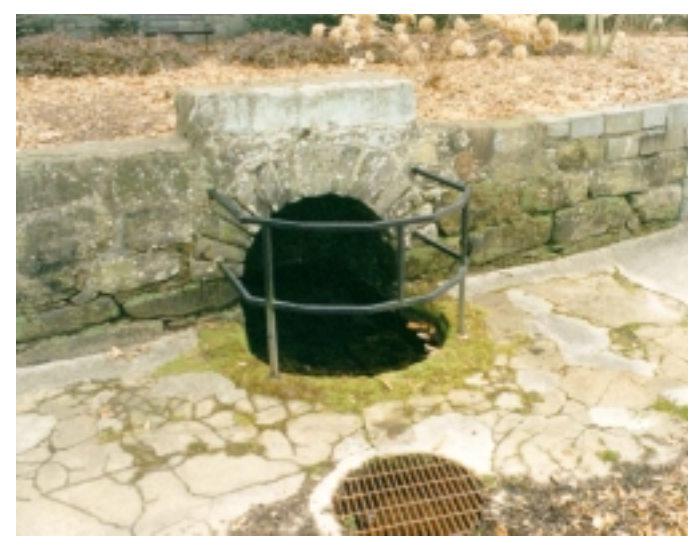
Waddy Thompson Spring, Greenville

As long as springs are protected they should continue to be a source of pleasure and inspiration for years to come. Perhaps a better understanding of the characteristics and history behind each spring will help bring about such protection and stewardship of this valuable resource.