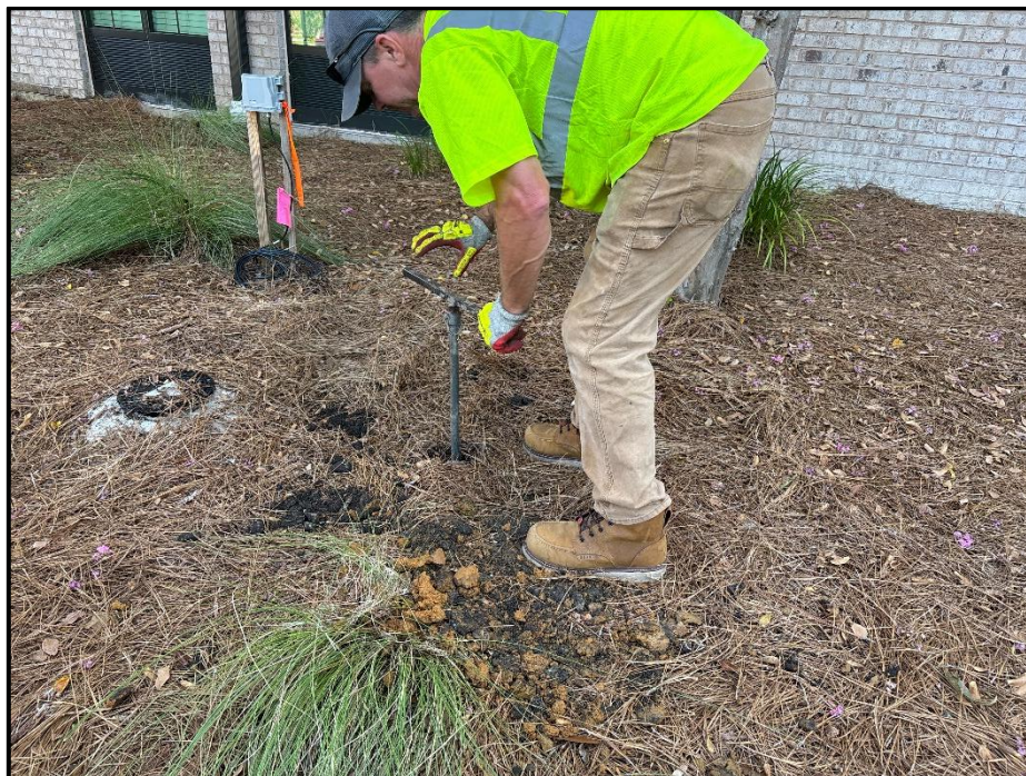
Figure 7: Hand Auguring at IT-1, facing Northeast