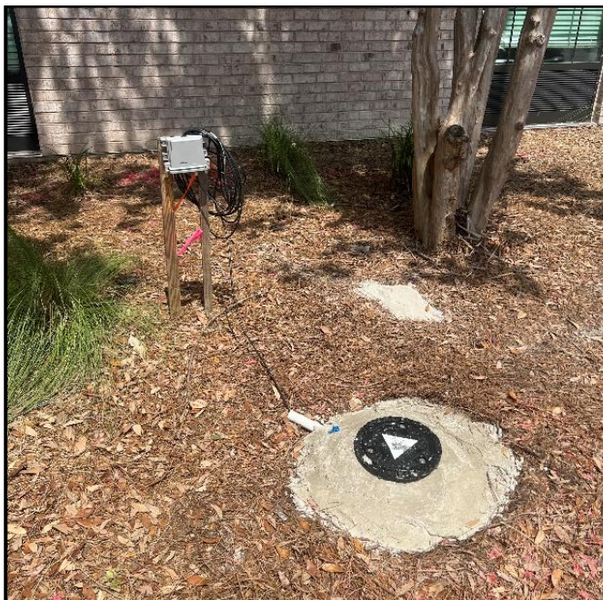
Figure 5: View of Completed PZ-1, facing East