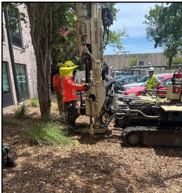
Figure 4: View of initial drilling for installation of PZ-1, facing South