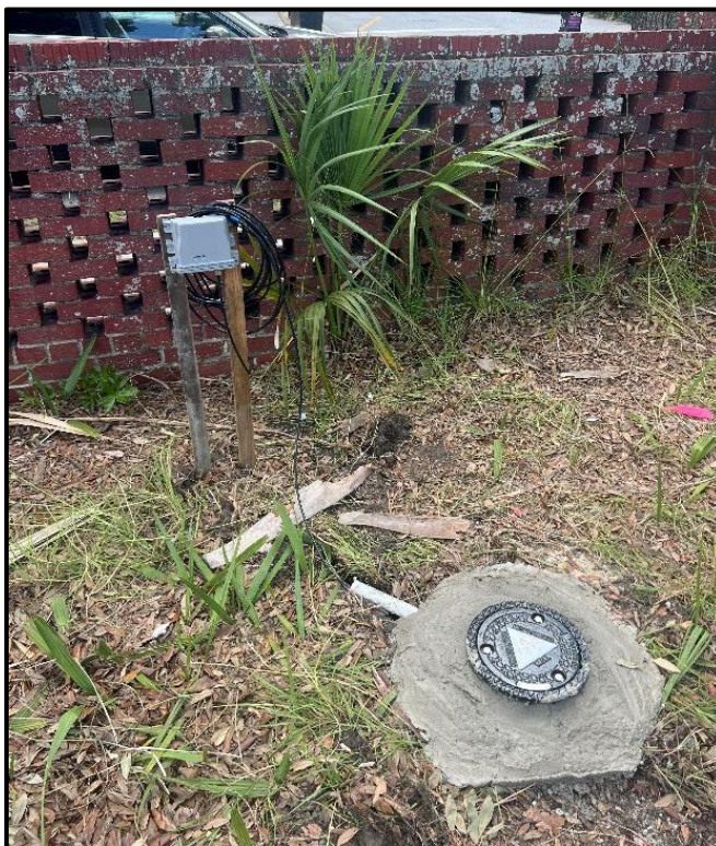
Figure 6: View of Completed PZ-2, facing West