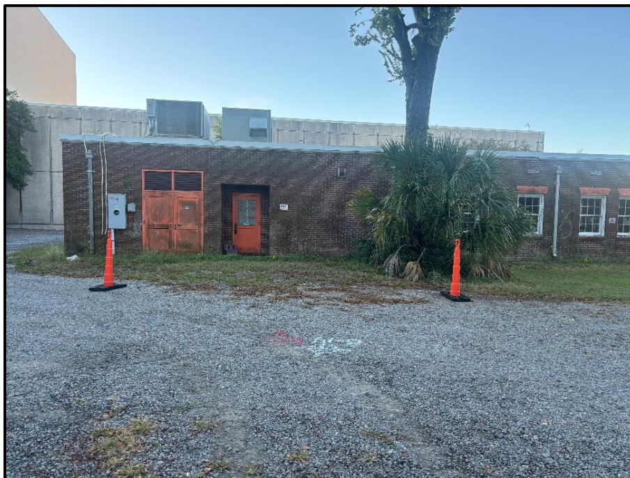
Figure 9: Site Conditions at B14, facing south