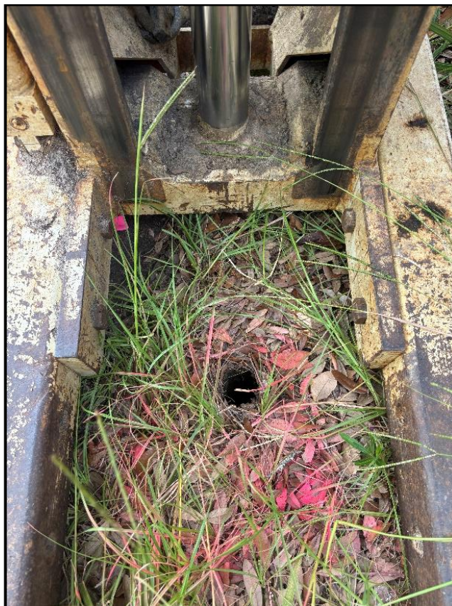
Figure 3: View of drilled opening for well installation of PZ-2