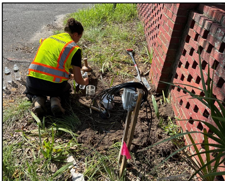
Figure 8: Site Conditions at IT-2, facing Southeast