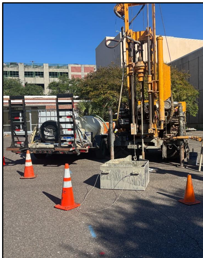
Figure 10: Soil Test Boring B13, facing east