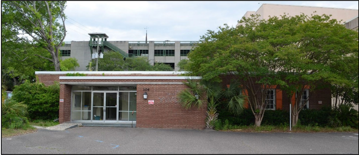
Figure 1: 106 Coming St. Charleston, SC. Former YWCA of Greater Charleston headquarters.