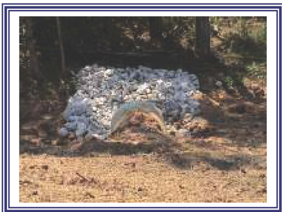
Riprap Outlet Protection