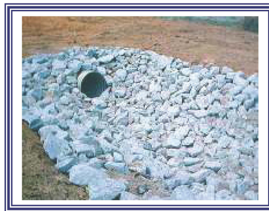
Riprap Outlet Protection