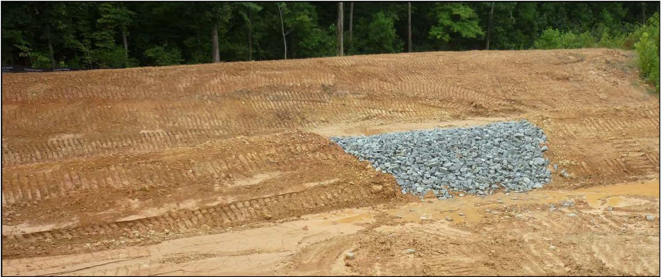
Photo: Sediment Forebay