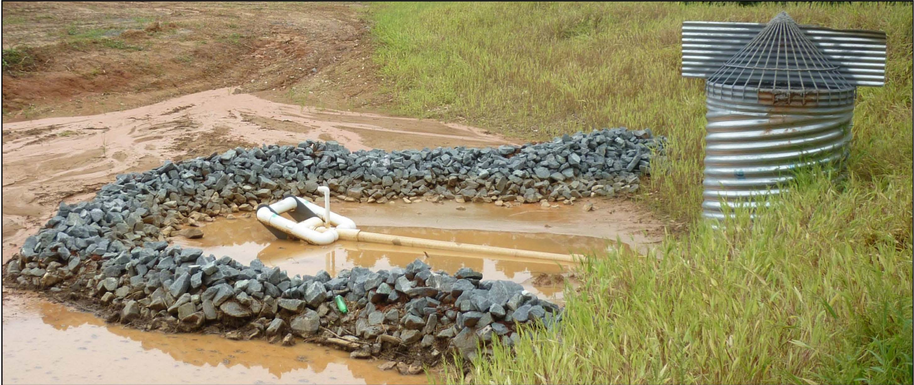
Photo: Horseshoe Rock Berm Around Principle Spillway with Skimmer