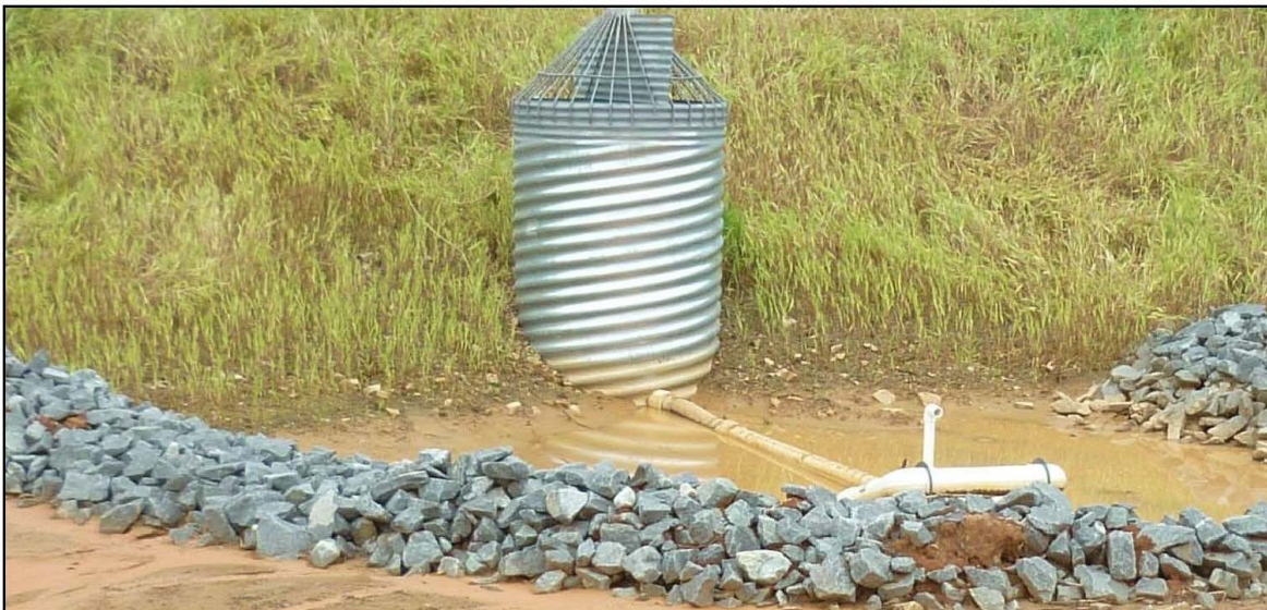
Photo: Principle Spillway's Riser Structure with Skimmer