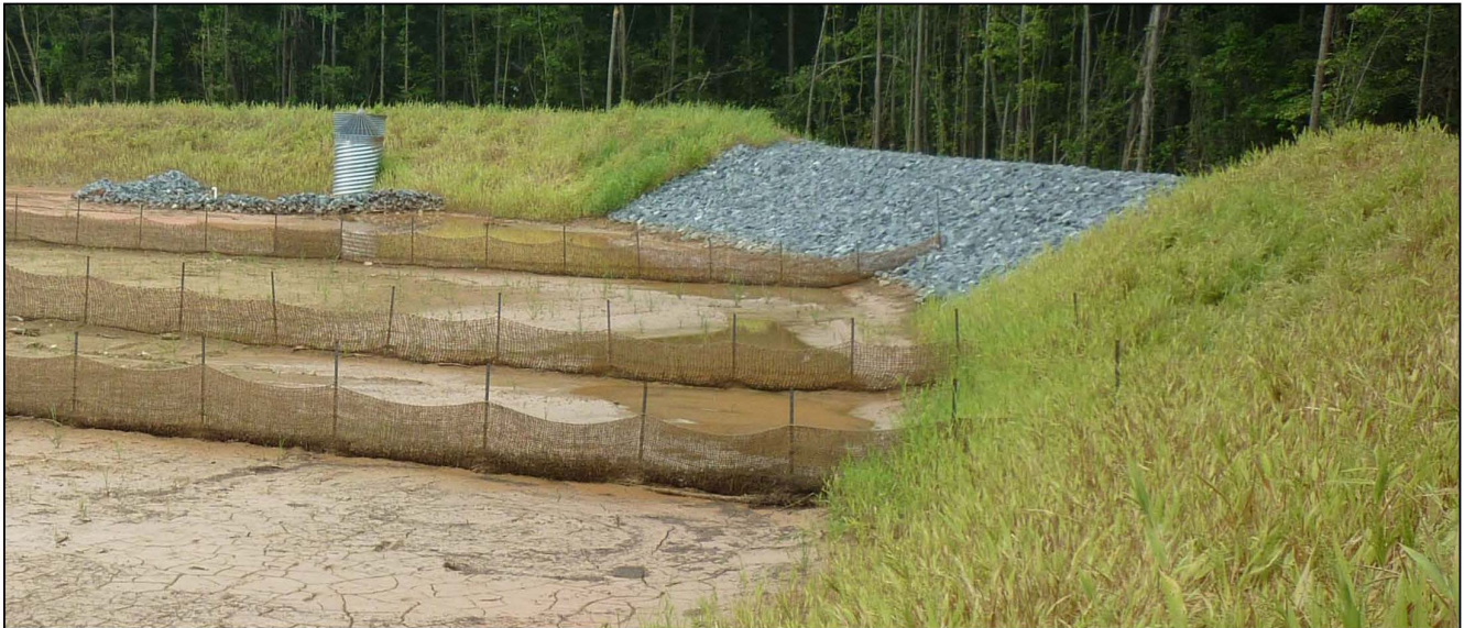
Photo: Porous Baffles