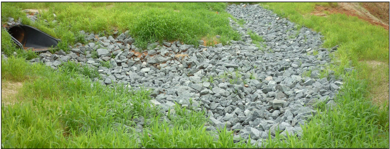
Photo: Principle Spillway's Barrel (Outlet Pipe) with Plunge Pool and Level Spreader

Each of the sediment basin's outlets shall be designed to prevent scour and to reduce velocities during peak flow conditions. This can be accomplished through the selection and design of energy dissipation structures such as riprap aprons. Each outlet should also be directed towards pre-existing point source discharges or be equipped with a mechanism to release the discharge as close to sheet flow as possible, to prevent the creation of new point source discharges. Try to restrict the outlets from being placed within 20 linear feet of adjacent properties lines.