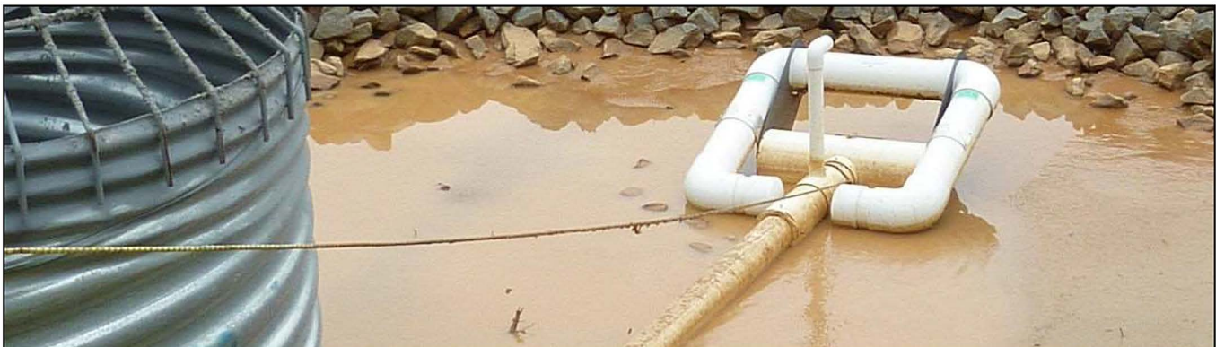
Photo: Skimmer with Attached Rope for Ease of Maintenance

Failing to follow this guidance would require review and approval of the "equivalent" skimmer prior to implementation (in most cases requiring a Major Modification of the approved plans). All skimmer data should be based off product-specific testing.