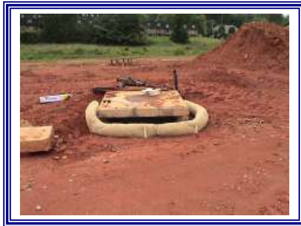
Sediment Tube Inlet Protection