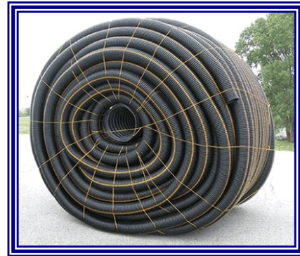
Subsurface Drain Pipe