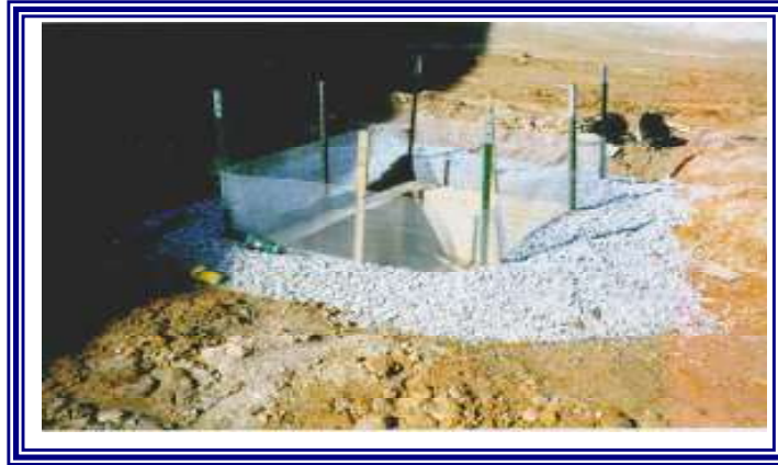
Hardware Fabric and Stone Inlet Protection