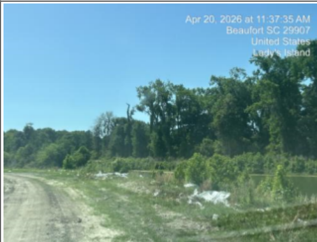
Photo Taken: 04/20/2026 11:37:00 AM GPS Latitude: 32.47016388888889 GPS Longitude: -80.65061111111112 GPS Altitude: 4.79 meters GPS Orientation: 1 degrees