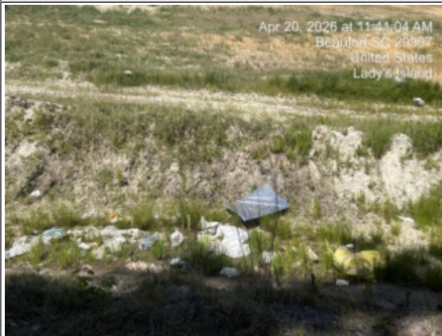
Photo Taken: 04/20/2026 11:41:00 AM GPS Latitude: 32.46866111111111 GPS Longitude: -80.64749722222223 GPS Altitude: 7.79 meters GPS Orientation: 1 degrees

Photo Taken: 04/20/2026 11:37:00 AM GPS Latitude: 32.47016388888889 GPS Longitude: -80.65061111111112 GPS Altitude: 4.79 meters GPS Orientation: 1 degrees