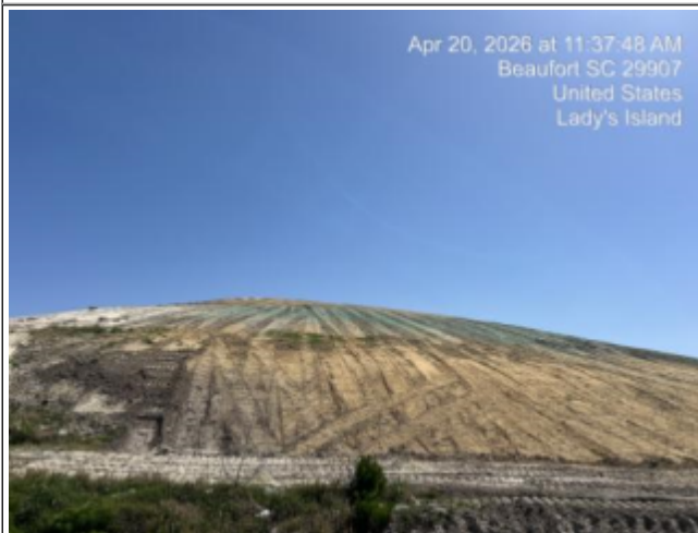
Photo Taken: 04/20/2026 11:37:00 AM GPS Latitude: 32.470163888888889 GPS Longitude: -80.65061111111112 GPS Altitude: 4.79 meters GPS Orientation: 1 degrees

Photo Taken: 04/20/2026 11:22:00 AM GPS Latitude: 32.470688888888894 GPS Longitude: -80.64880277777779 GPS Altitude: 18.3 meters GPS Orientation: 1 degrees