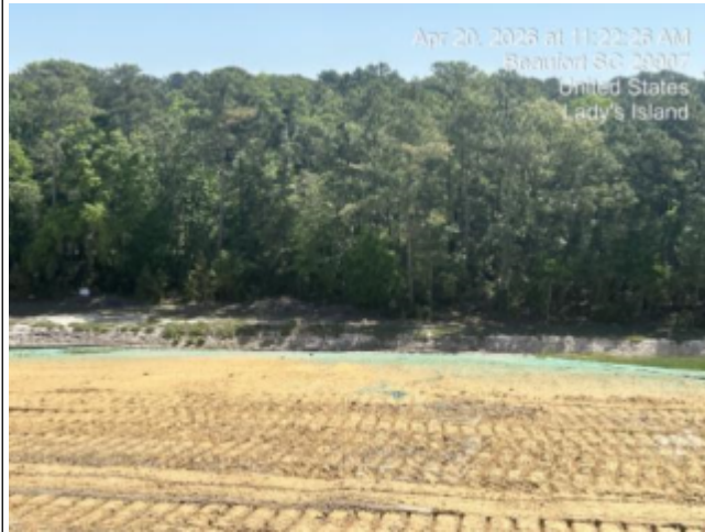
Photo Taken: 04/20/2026 11:22:00 AM GPS Latitude: 32.470688888888894 GPS Longitude: -80.64880277777779 GPS Altitude: 18.3 meters GPS Orientation: 1 degrees