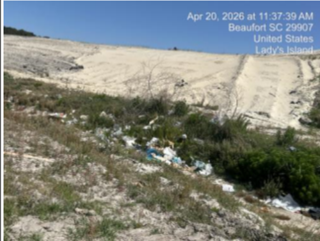
Photo Taken: 04/20/2026 11:37:00 AM GPS Latitude: 32.47016388888889 GPS Longitude: -80.65061111111112 GPS Altitude: 4.79 meters GPS Orientation: 1 degrees