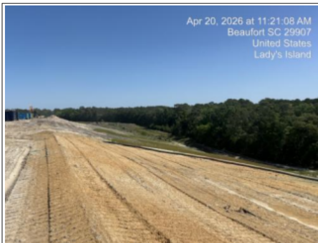
Photo Taken: 04/20/2026 11:21:00 AM GPS Latitude: 32.470688888888894 GPS Longitude: -80.64880277777779 GPS Altitude: 18.3 meters GPS Orientation: 1 degrees

Bare slopes have been hydroseeded and facility has done some manual watering, but lack of rain is making growth slow. Working face will be moved soon to the south end of the landfill peak. Operator states they have chosen a contractor for a gas management system, with final plans due to be presented to Solid Waste and Air teams in Columbia soon for approval.