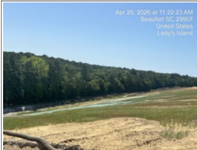
Photo Taken: 04/20/2026 11:22:00 AM GPS Latitude: 32.470688888888894 GPS Longitude: -80.64880277777779 GPS Altitude: 18.3 meters GPS Orientation: 1 degrees

Photo Taken: 04/20/2026 11:21:00 AM GPS Latitude: 32.470688888888894 GPS Longitude: -80.64880277777779 GPS Altitude: 18.3 meters GPS Orientation: 1 degrees