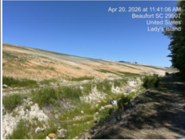
Photo Taken: 04/20/2026 11:41:00 AM GPS Latitude: 32.46866111111111 GPS Longitude: -80.64749722222223 GPS Altitude: 7.79 meters GPS Orientation: 1 degrees