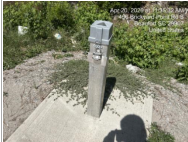
Photo Taken: 04/20/2026 11:35:00 AM GPS Latitude: 32.4726027777778 GPS Longitude: -80.6512 GPS Altitude: 5.22 meters GPS Orientation: 1 degrees

MW4 noted on last inspection is now locked. New locks on all wells have been installed.