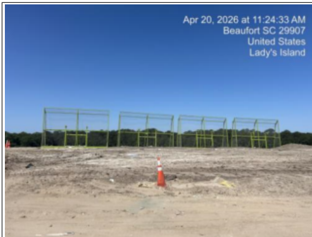
Photo Taken: 04/20/2026 11:24:00 AM GPS Latitude: 32.47134444444445 GPS Longitude: -80.64885555555556 GPS Altitude: 25.41 meters GPS Orientation: 1 degrees

Litter fences have been installed up top adjacent to working face, but wind blown litter in ditches is still significant.