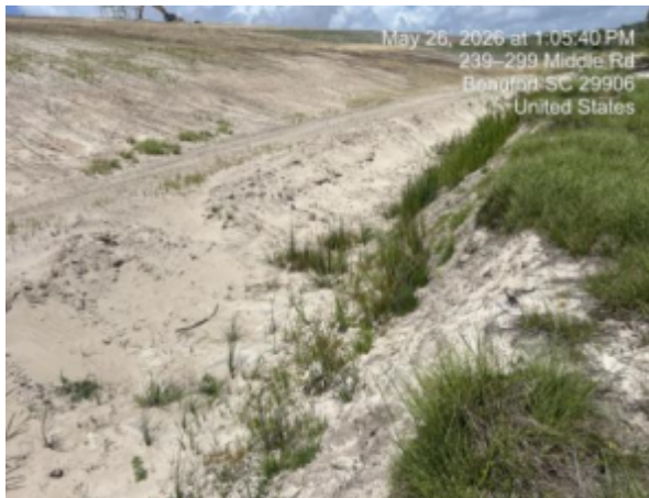
Photo Taken: 5/26/2026 1:05:00 PM GPS Latitude: 32.471136 GPS Longitude: -80.647772 GPS Altitude: 7.780000 meters GPS Orientation: 1 degrees