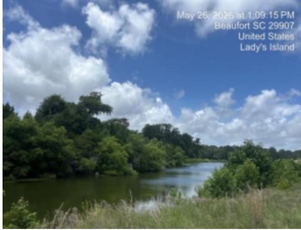
Photo Taken: 5/26/2026 1:09:00 PM GPS Latitude: 32.467761 GPS Longitude: -80.648452 GPS Altitude: 10.270000 meters GPS Orientation: 1 degrees