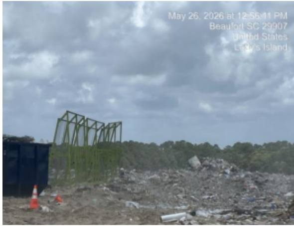
Photo Taken: 5/26/2026 12:56:00 PM GPS Latitude: 32.471322 GPS Longitude: -80.648925 GPS Altitude: 27.320000 meters GPS Orientation: 1 degrees