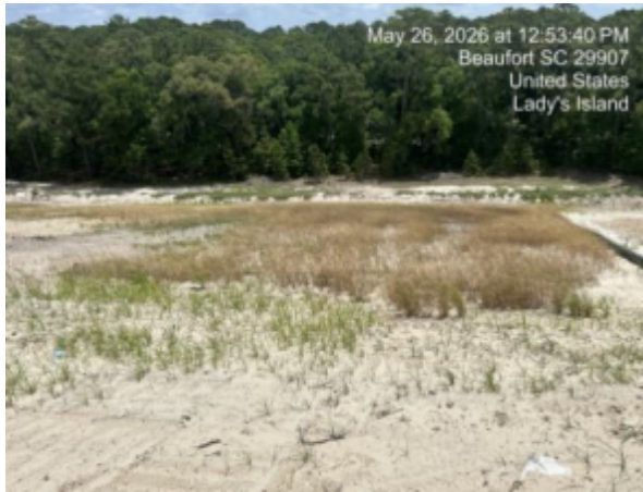
Photo Taken: 5/26/2026 12:53:00 PM GPS Latitude: 32.470919 GPS Longitude: -80.648688 GPS Altitude: 30.880000 meters GPS Orientation: 1 degrees

Photo Taken: 5/26/2026 12:53:00 PM GPS Latitude: 32.470997 GPS Longitude: -80.648925 GPS Altitude: 13.610000 meters GPS Orientation: 1 degrees