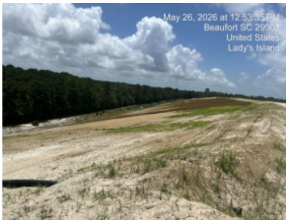
Photo Taken: 5/26/2026 12:53:00 PM GPS Latitude: 32.470997 GPS Longitude: -80.648925 GPS Altitude: 13.610000 meters GPS Orientation: 1 degrees

Eastern slope grass has moderate growth, still some bare spots.