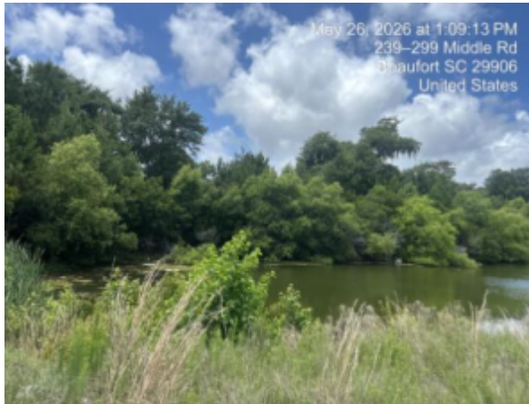
Photo Taken: 5/26/2026 1:09:00 PM GPS Latitude: 32.467761 GPS Longitude: -80.648452 GPS Altitude: 10.270000 meters GPS Orientation: 1 degrees