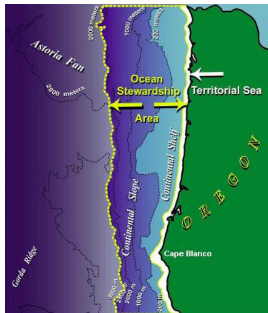
Figure 1. Ocean Stewardship Area as defined in Ocean Resources Management Plan.

authority over management, policy, or programs that affect the marine environment), Oregon Sea Grant, and other non-voting members. The OPAC continues to meet quarterly with staff support from the DLCD (Oregon DLCD, 2005). While the Ocean Policy Advisory Council has no regulatory authority, state agencies are required to carry out or act consistently with the Council’s recommended policies once approved by the Land Conservation and Development Commission as a part of Oregon's Coastal Management Program (Oregon DLCD, 2005). Using the earlier Ocean Plan as a framework, and holding statewide public input meetings and working with federal partners, the council spent three years developing a “Territorial Sea Plan,” which focused on state waters out to 3 nm. The Territorial Sea Plan established policies and procedures,