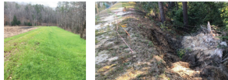
Well Maintained Dam (left), Uprooted Trees (right)

DHEC recommends removing tree saplings as soon as they appear; a permit is not required to remove trees less than 4 inches in diameter. Generally, trees larger than 4 inches in diameter also require removal of the stump and roots. Because stump removal can affect the structural integrity of the dam, a permit to remove the trees and stumps through a tree management plan created by a South Carolina licensed professional engineer is needed. If you have any questions, please call the Dams and Reservoirs Safety Program at 803-898-4050 or email us at response@dhec.sc.gov .