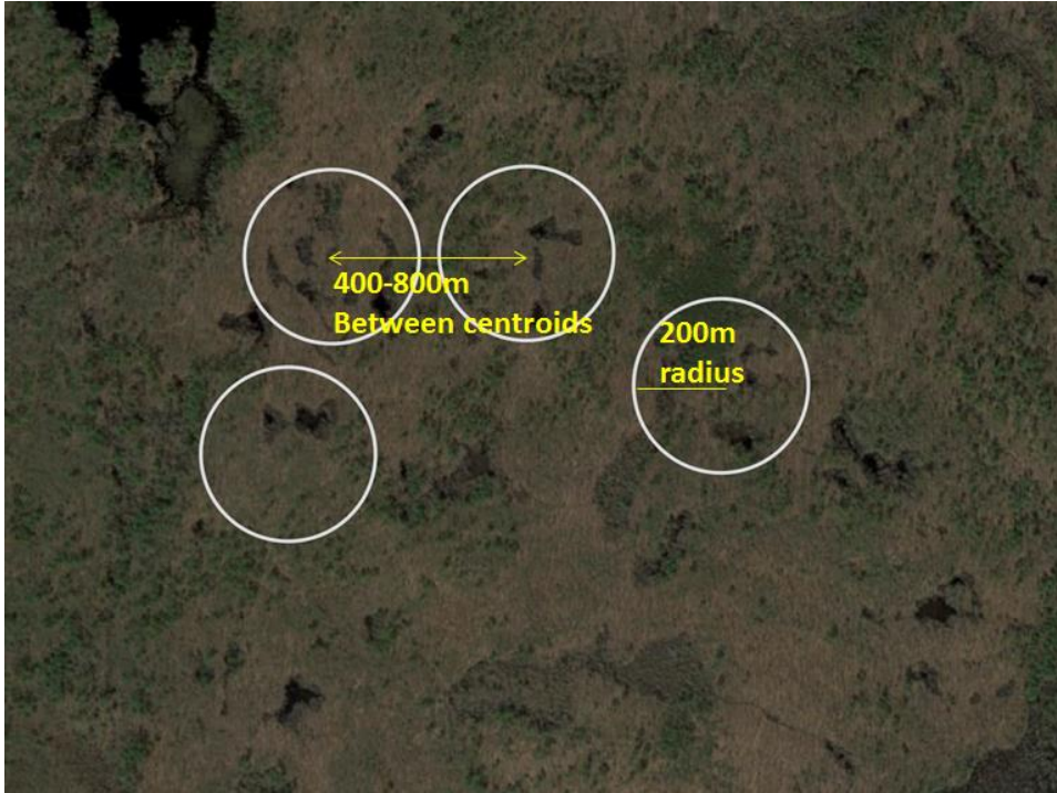
Figure 1. Illustration of study site delineation in Google Earth. The yellow central dots illustrate Reference Points centered on areas of suitable (or potentially suitable) Spotted Turtle habitat, surrounded by reference plots with 200-m radius.