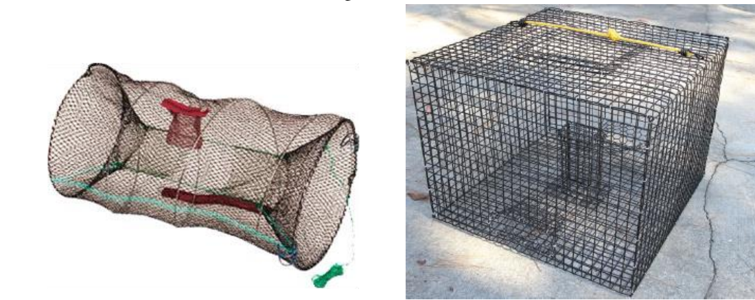
Figure 2. ProMar TR502 (left) and modified crab trap from Chandler et al. (2017)

Trap identification: Assign unique ID to each trap and label trap in the field and on the corresponding field form.